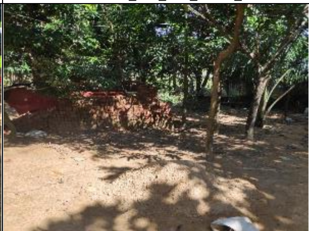
4. Block-B_16 ID:EMCRP_WD_07A_DTTW_19.41