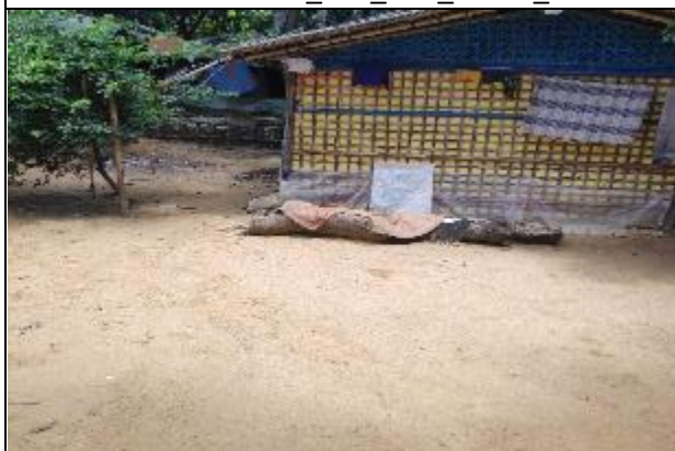
5. Block-B_19 ID:EMCRP_WD_07A_DTTW_19.33