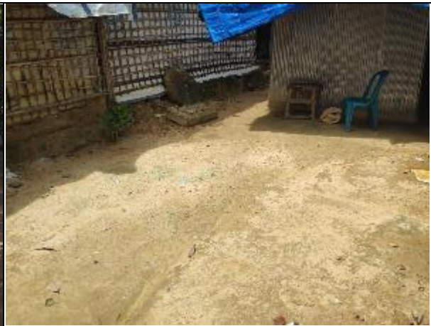
2. Block-B_15. ID: EMCRP_WD_07A_DTTW_19.39