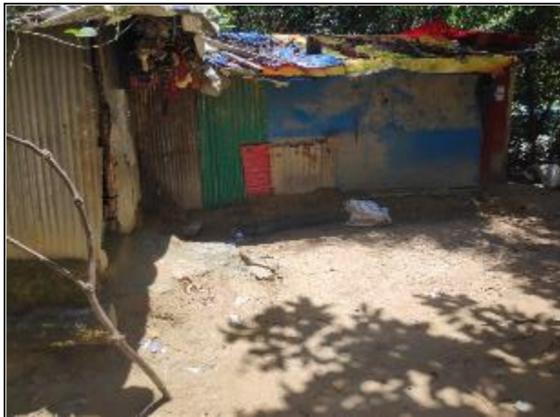
1. Block-B_08. ID: EMCRP_WD_07A_DTTW_19.29