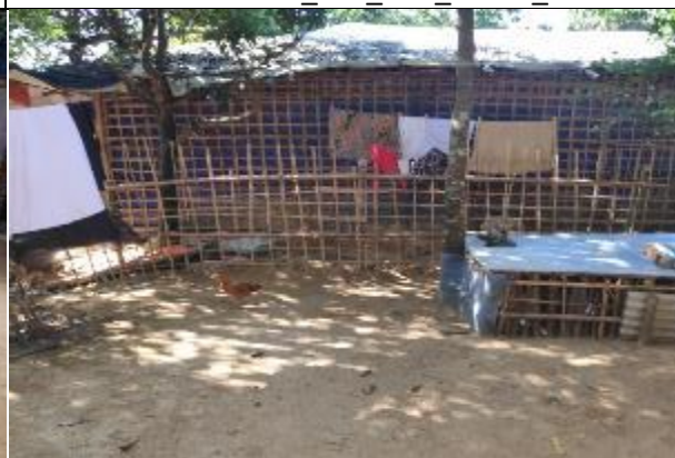
6. Block-D_01 ID: EMCRP_WD_07A_DTTW_19.62