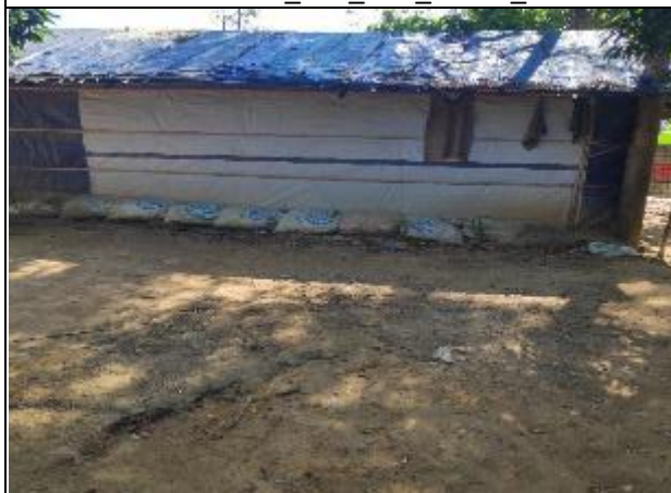
3. Block-B_09 ID:EMCRP_WD_07A_DTTW_19.31